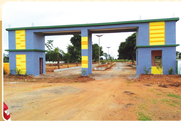
Sparrowshore Avenue @ Kothur