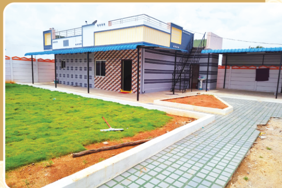
Sparrowshore @ Dubbacherla